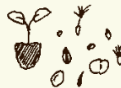
seeds and seedlings