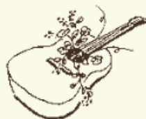
DAD'S TREASURED GUITAR!

Imagine having edible gardens on the streets you walk on. Let's see if you can spot a place to make a garden!