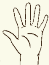
your hands (or a trowel)